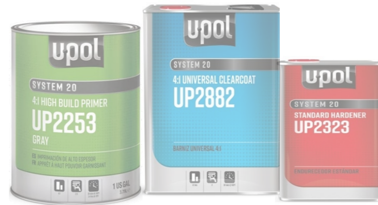
Clears and Primers