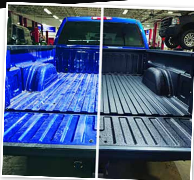
Use of RAPTOR in traditional bedliner application.

Reduce key-to-key times and unlock your earnings potential by completing all new bedliner installations in-shop with common spray equipment in the shop. You control the process, set the price, and earn the profit instead of sending work out to a third party.