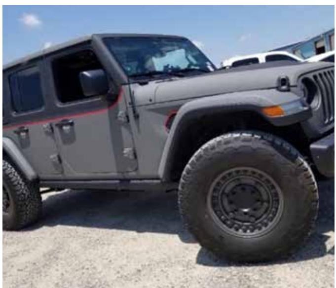
Tintable RAPTOR with various textures to create upgrade package at dealership.

In addition to bedliner, you may also create custom upgrade packages to wheels and other vehicles accessories. With RAPTOR, the opportunities are endless for upselling protection packages with their vehicle purchases.