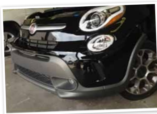
Tintable RAPTOR applied as a protective chip guard coating over waterborne basecoat.

RAPTOR is available in black and tintable, can be painted or used as a textured topcoat. Apply RAPTOR to match a variety of OEM textures from extra fine to coarse, and list the cost of materials as a billable item on repair orders.