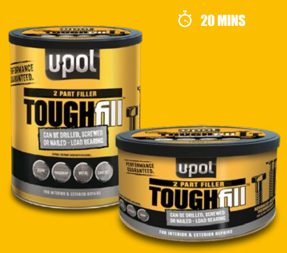
U-POL TOUGHfill<sup>™</sup> is a two-part polyester filler that has been specifically designed to work in high-demand environments, where toughness is paramount. U-POL TOUGHfill<sup>™</sup> can be used to repair holes, dents, splits and cracks, making it an ideal partner to repair or provide extra holding strength on most surfaces.