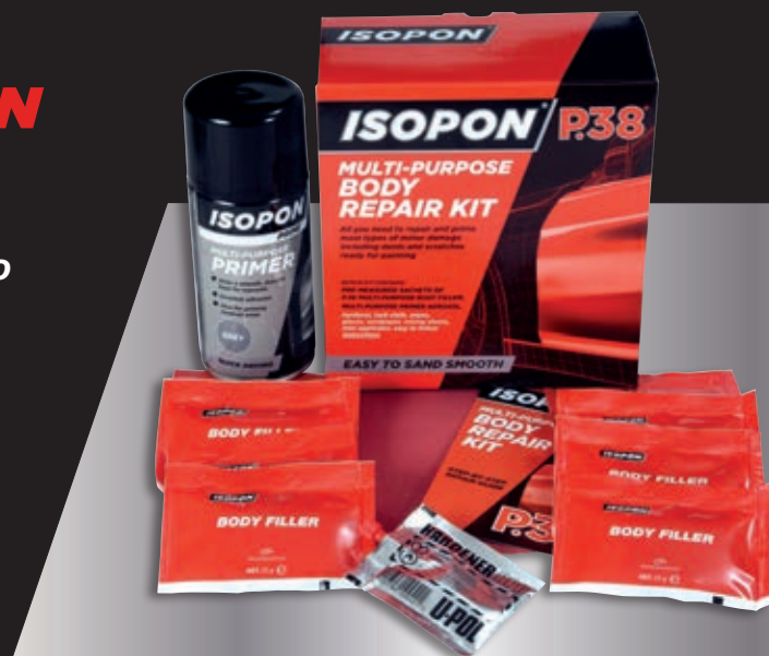
Isopon Kit Contents