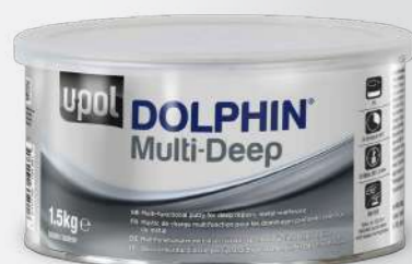
DOLPHIN MULTI-DEEP is a high-density metal reinforced putty

OUR RANGE OF INNOVATIVE AND TECHNICALLY ADVANCED PUTTIES IS IDEAL FOR ANY TYPE OF REPAIR WHERE QUALITY AND PERFORMANCE ARE KEY. CONVENIENT TO USE, EASY TO APPLY AND TO SAND, THEY ALSO GIVE YOU SUPERIOR VERTICAL HOLD AND EXCELLENT PINHOLE RESISTANCE.